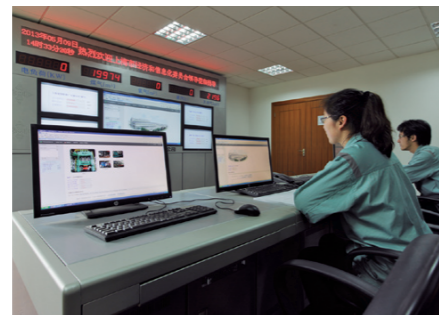
Fig.1: Energy monitoring control center (能源监控中心) of Shanghai Heavy Machinery Plant Co., Ltd.