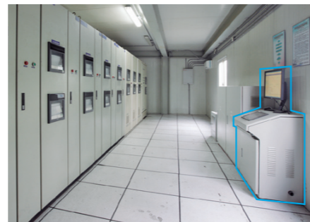
Fig.2: Considerably-miniaturized process management system for a forging furnace. The equipment on the left in the picture is the existing system with pen recorders. The terminal of the new control system using CC-Link IE is on the right in this picture.

two years since 2009 together with Shanghai Electric Ryoden Energy Saving and Control Technology (SERT), who handles energy control systems and FA systems. (For more information on SERT, refer to the associated article.)