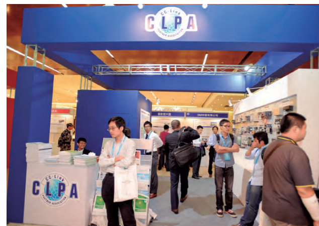
Exhibition booth of CLPA

Another significant problem he pointed out is the need for a mechanism to send large amounts of transient (asynchronous) data generated by production lines to upper level information systems. "In FPD manufacturing lines, the linkage with the information system that controls production, product quality, and energy is becoming more important than ever", he said. To respond to this demand, CC-Link IE, which has a high-speed data transmission speed of 1Gbps, has a function that divides the transmission band between cyclic communication for control and transient communication for production control. Features like these are highly suited to the FPD manufacturing process, meaning CC-Link IE will become stronger and stronger in the FPD industry, following the success of its predecessor, CC-Link.