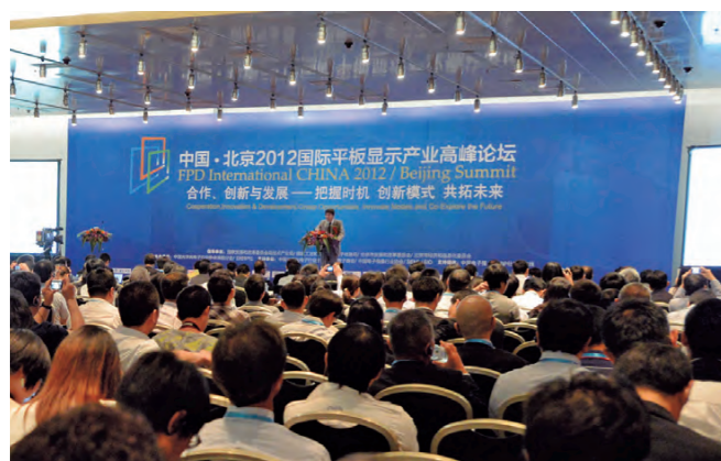
Keynote speech in FPD International China 2012/Beijing Summit

In this track, speeches were made by the Instrumentation Technology and Economy Institute (ITEI), a research institute related to industrial automation, Mitsubishi Electric, CLPA, Beijing BOE Display Technology, a major FPD manufacturer in China, Canon Tokki, a major FPD machine manufacturer, and S.Y. Technology, Engineering and Construction, a major engineering company in China. Mitsubishi Electric described solutions based on CC-Link for factory efficiency. CLPA explained its recent activities and benefits that the CC-Link technology provides for the FPD industry. Finally, Beijing BOE Display Technology and Canon Tokki described actual CC-Link applications.