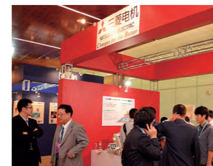
Exhibition booth of Mitsubishi Electric

Another important role of Mitsubishi Electric in the FA field is as a leading developer of CC-Link and CC-Link IE, which are global standards for industrial open networks. "Among many standards for industrial open networks, CC-Link has a high market share, especially in Asia. This success is being continued by CC-Link IE, which uses the physical layer of Gigabit Ethernet", he continued.