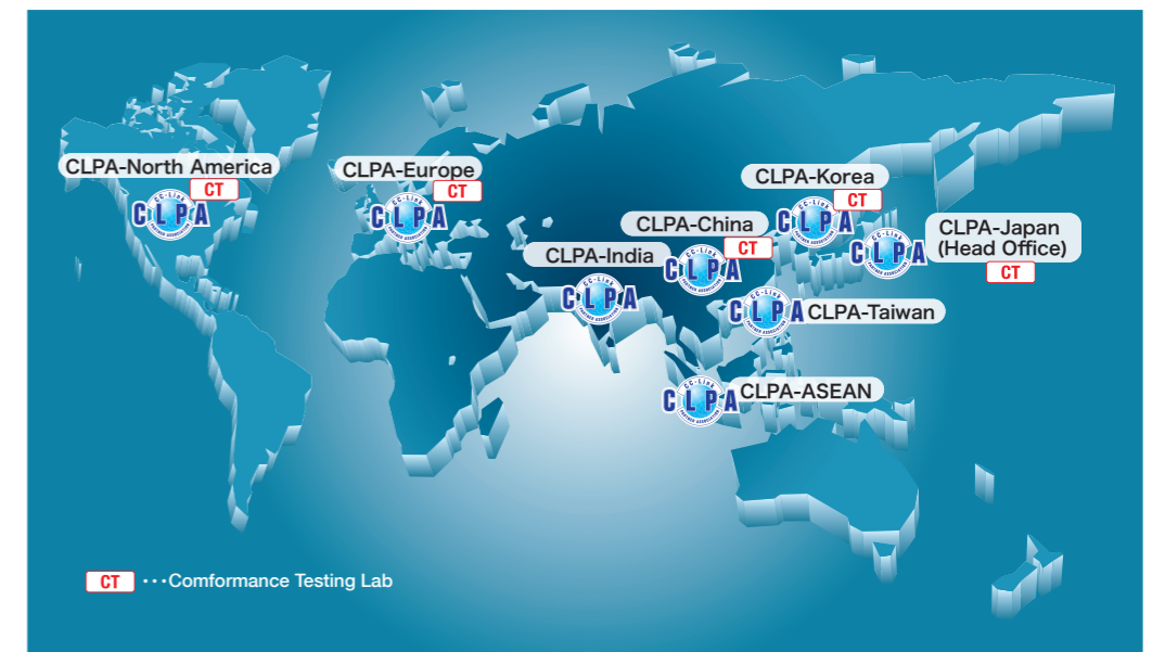
Figure 2 : CLPA world branches

As support for product development, CLPA distributes a development support kit containing the