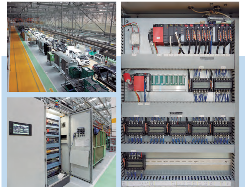
Inside the 2nd factory of FAW Car Co., Ltd., and installed CC-Link devices.