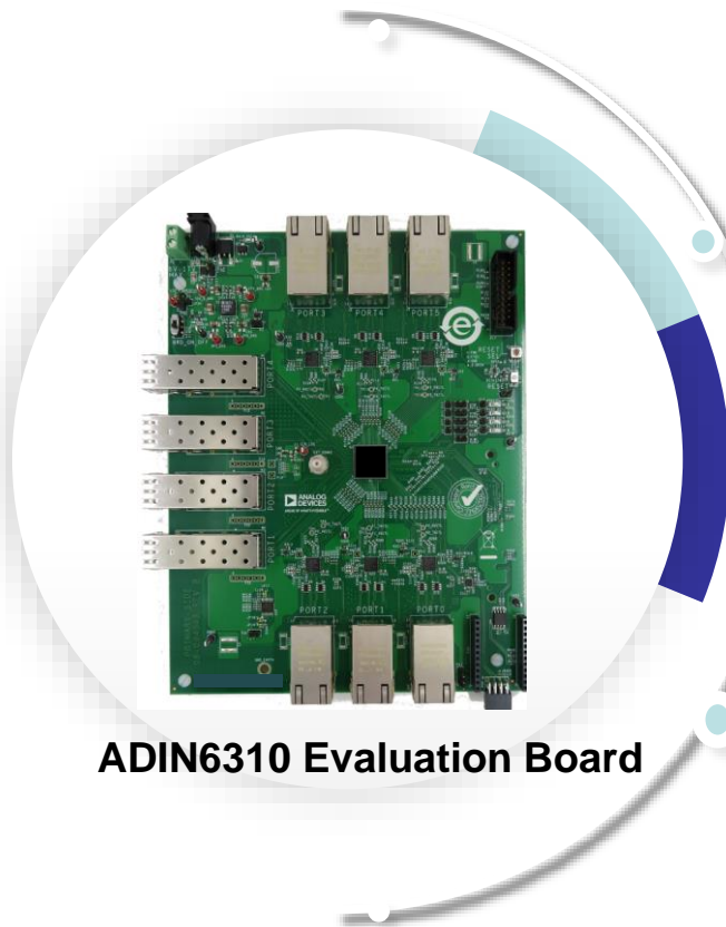
ADIN6310 Evaluation Board