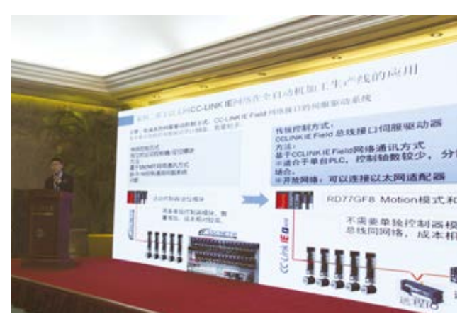
Introducing a case study utilizing CC-Link IE for handling LCD panels at Nanjing Panda Electronics Co., Ltd.

ITEI is not only responsible for formulating standards but also has a role in their wide-spread promotion, and is working in collaboration with CC-Link Partner Association to create a model production line. CC-Link IE currently boasts a high market share among Chinese production sites; with domestic standard acquisition and the ITEI promotion as an ally, it is expected that further widespread adoption will accelerate.