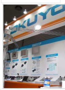
HOKUYO AUTOMATIC CO., LTD.