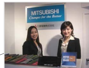
MITSUBISHI ELECTRIC CORPORATION