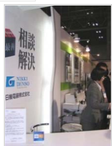
NIKKI DENSO CO., LTD.