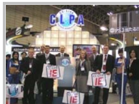
CLPA Promotion Partners visited CLPA booth from Poland, Ukraine