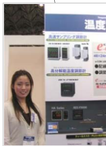
RKC INSTRUMENT INC.