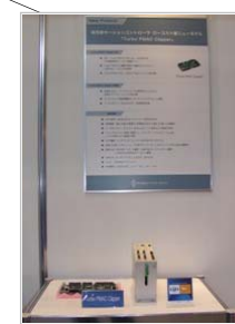
PMAC JAPAN CO., LTD.