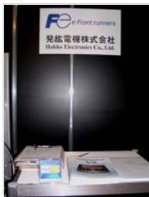
Hakko Electronics Co., Ltd.