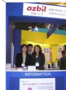
Tem-Tech Lab. Co. Ltd