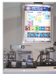
Harmonic Drive Systems, Inc