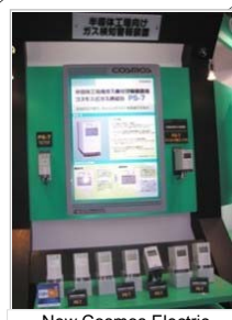
New Cosmos Electric Co., Ltd.