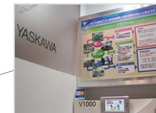
YASKAWA ELECTRIC CORPORATION