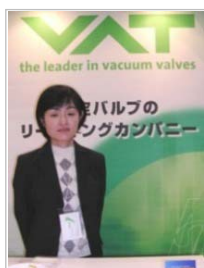
VAT Vakuumentile AG