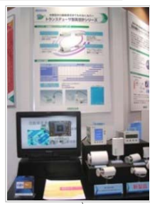
Canon ANELVA TECHNIX CORPORATION