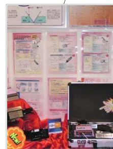
Technical & Try CO., LTD.