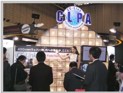
There were over 2,500 visitors in CLPA booth. We made a presentation of CC-Link IE Field Network's concept.