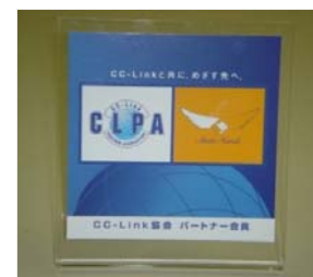
【 Shake Hands stand 】

CLPA Partners' were everywhere at SEMICON Japan 2008. There were 53 CLPA partners in the hall and 28 of them agreed to display the "Shake Hands stand". Thank you for the cooperation!!