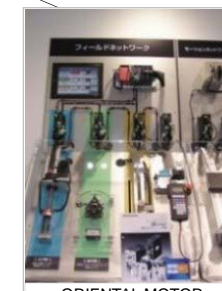
ORIENTAL MOTOR CO., LTD.