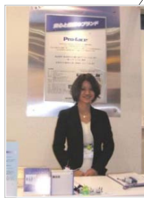
DIGITAL ELECTRONICS CORPORATION